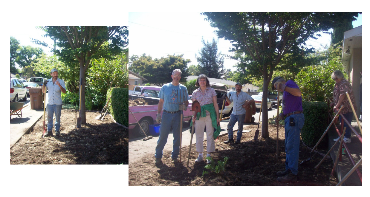
Thank you Volunteers Come Spring the yard will take on a new look.