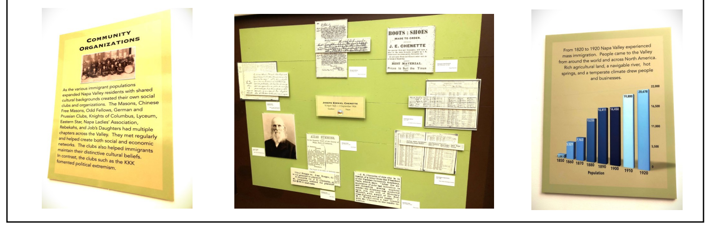
Photos from Opening Night of the "City of Immigrants: An American Story" Exhibit

The Napa Historical Society is located at 1219 First St., Napa, and is open Tues/Weds/Thurs 10 AM-3 PM and Fri-Sat 10 AM-5 PM. A sister exhibit will be displayed at the St. Helena Historical Society, located at 1255 Oak Ave., St. Helena, beginning in November. Call 707-967-5502 for additional information. Visit the exhibits at both venues through March 30, 2024. No charge for admission, although donations are welcomed.